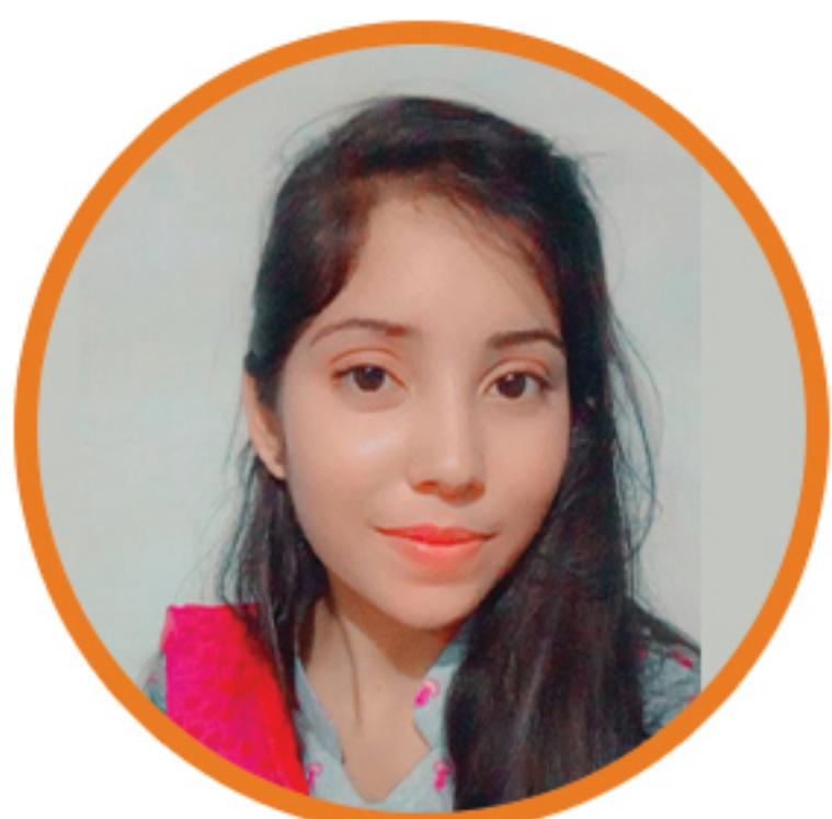
Kruna Turkar Apollo Hospital Bhopal